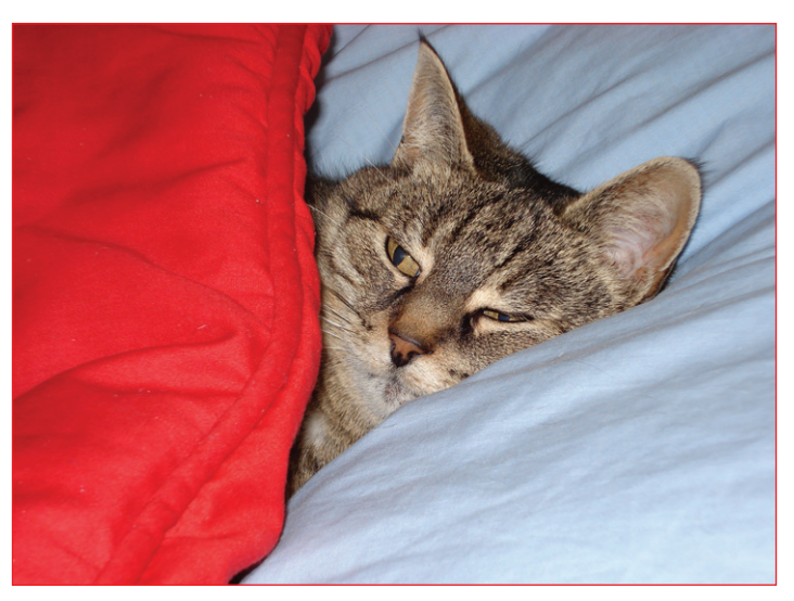
Chat de sommeil: At ease on Santa Barbara's American Riviera, Bip preferred a real bed rather than one designated for "pets."