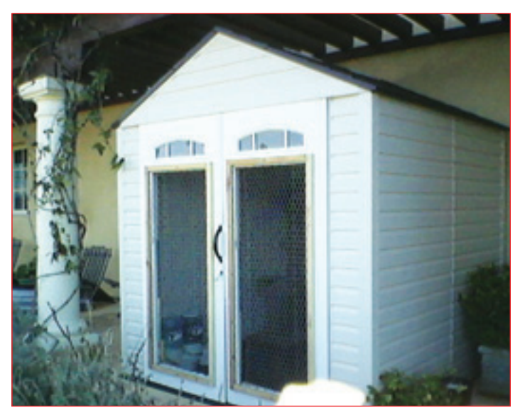
Luxury Condo: The relocation shed for the Main/Blosser kitties at the Clos Pepe Winery near Lompoc is more than basic shelter.