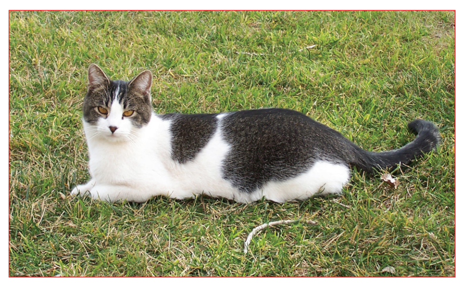
Carefree: Rescued from death row in Santa Maria and his reputation for missing his litter box, this good-looking boy was first relocated to a barn situation in Buellton. And that's where his adventure began!

During the holidays PeePee Pants suddenly came up missing and everyone feared the worst as there were hungry